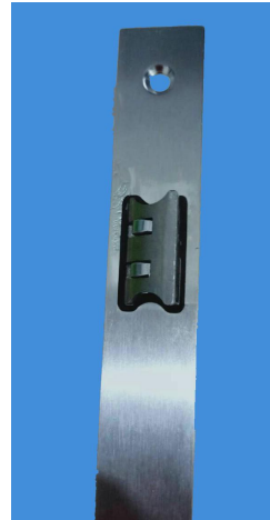
新款 The new one

二、斜舌和方舌四周包裹一层优质尼龙静音组件，很好的实现了配件之间的静音降噪功能。集顺畅静音与顺滑等功能于一身。