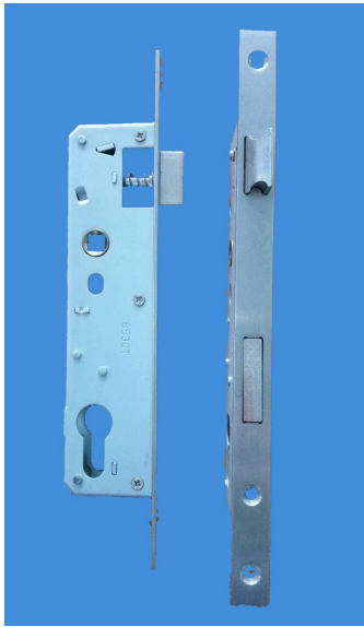
老款 The old one

The panel and the main body shell are made of high-quality carbon steel, and the internal structure is modularly assembled. The exterior is smart and durable, making the product more durable.