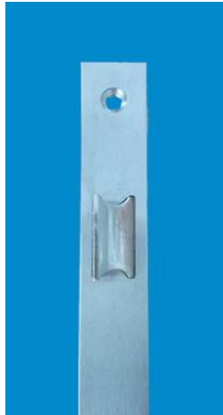
老款 The old one